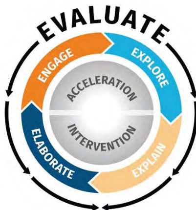
Five E + IA Instructional Model

Members of the Alabama State Science Course of Study Committee and Task Force support the use of inquiry-based instructional models such as the following Five E + IA Instructional Model.* This model complements the three-step planning process described on the preceding page.