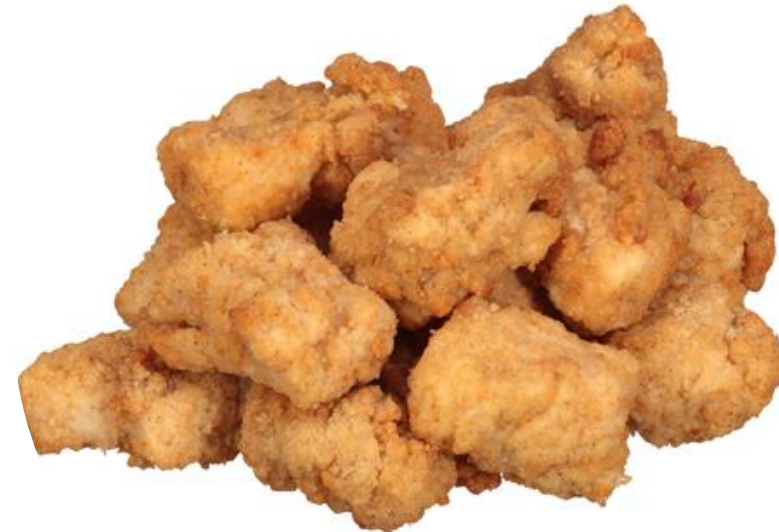
Dill Flavored Chicken Nuggets and Filets