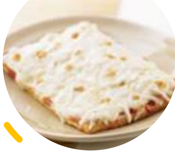
100% Mozzarella Pizzas