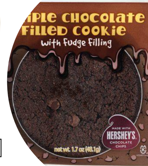
Chocolate and Frosting Filled Cookies, IW