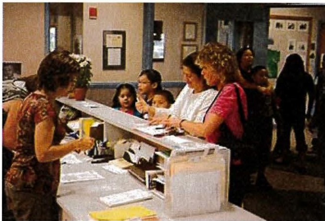
Student and Parent/Guardian

A variety of resources are provided to our students to discourage the decision to drop out of school. All students and parent/legal guardians arriving to the school to withdraw/drop out will be encouraged and counseled to reconsider. If a student and parent/legal guardian insist on signing a withdrawal form, the following tasks will be performed to begin the Student Exit Interview process: