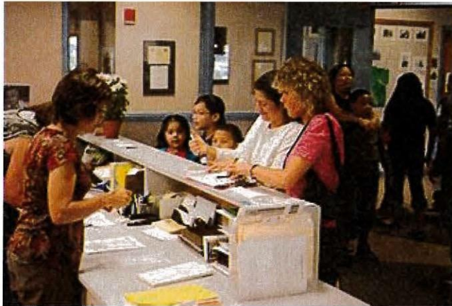
Student and Parent/Guardian

A student exit interview is scheduled at a time that ensures the availability of school staff that is most familiar with the student's history and the administrative staff that has authority to support plans of intervention.